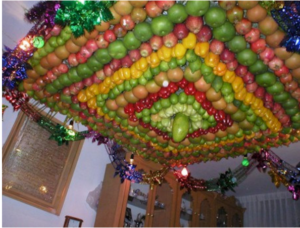
FIGURE 2. A Samaritan-Israelite sukkah

open house at presidential residence featuring the Samaritan sukkahs. ]