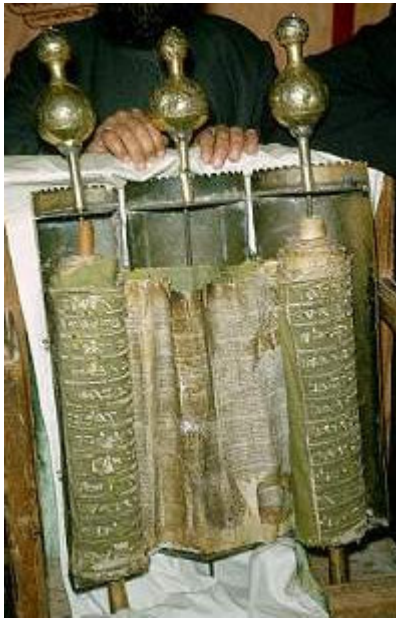
Figure 1 The famous Abisha scroll

The Samaritans have many times displayed to visitors their most sacred Scroll over the years. It is not allowed for any one Samaritan to show the Scroll alone. In the early 1900’s, the Samaritans allowed each page of the scroll to be photographed. The Scroll bearing traces of its antiquity where parts have become illegible and some letters have been rewritten.